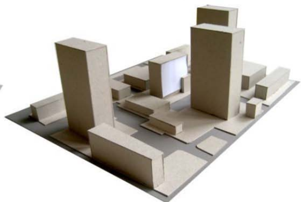
De-Beauvoir Road, 10 Storey Scheme to provide 39 units for social rental.